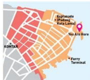
Map of George Town UNESCO World Heritage Site

For centuries, George Town has been the port of call for ships from all over the world. Today, the sense that overwhelms every traveller here is no different from when the founder Captain Francis Light and his first settlers made land here in 1786 - the desire to explore, discover and indulge.