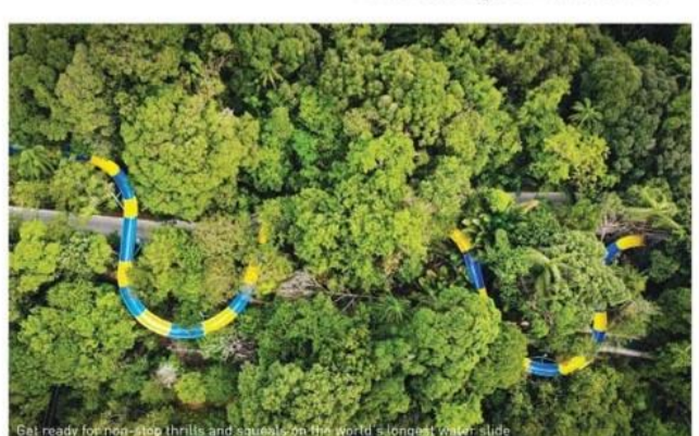
Get ready for the top thrill and take on the world's longest water slide

Looking for exciting adventures and adrenaline-pumping thrills? Experience it all at ESCAPE where lots of exciting attractions await! Don't miss the chance to ride the world's longest water slide, measuring an impressive 1,111m! Winding through enchanting jungle treetops, this Guinness World Record water slide is packed with twists and turns for a mind-blowing four-minute ride.