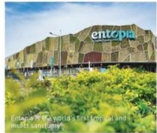
Entopia: The world's first tropical and insect sanctuary

Another way to experience the wonders of nature is to visit Entopia by Penang Butterfly Farm, nature's largest classroom and discovery hub, where butterflies and insects are free to come out and play. This venue is actually two different worlds side by side; The Natureland living outdoor gardens and The Cocoon indoor discovery centre. Over 150 species of fauna and more than 200 species of flora call this man-made wonderland home.