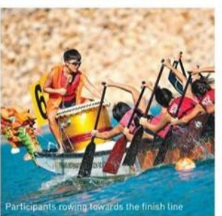
Participants rowing towards the finish line

Every year, the Penang International Dragon Boat Festival is held at the Teluk Bahang Dam in honour of the spirit of the dragon and the spirit of unity as the participants work together as a team for one common purpose. Spectators will get a thrill out of watching the boats adorned with colourful dragon heads and tails race each other to the finish line - truly an event of power, speed and endurance. The festival is usually held in December. To find out more, visit mypenang.gov.my