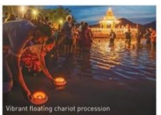
Vibrant floating chariot procession

The Floating Chariot Procession (Masi Magam Theppa Thiruvizha) is a Hindu festival that attracts tens of thousands of devotees to Sri Singamuga Kaliyamma Temple between mid-February and mid-March. The ceremony is held to thank the Goddess, Sri Singamuga Kaliyamma for her good grace and to ask her for protection and prosperity. During this elaborate procession, the Goddess will be carried on a floating chariot adorned with lights and flowers along the seaside of Teluk Bahang.