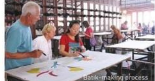
batik printing process

Interested in learning more about batik culture? Head over to Penang Batik Factory and join the free guided daily tour around the art gallery, boutique and factory where hand-drawn, manually block-printed and hand-painted batik are produced. Unlike the usual one-sided print, every fabric piece here is unique as it has patterns and colours on both sides.