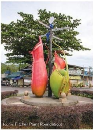
Iconic Pitcher Plant Roundabout

Beauty. Serenity. Harmony. These words describe Teluk Bahang very well. Its name means 'bay of heat wave' which refers to the hot sea breeze that blows onto the coast. This small, idyllic fishing village is situated at the northwestern tip of Penang Island. Ironically, it is considered as part of the Southwest Penang Island District, which extends to include the majority of the island. Its soothing and welcoming atmosphere complements the beautiful natural landscapes that can be seen throughout the village.