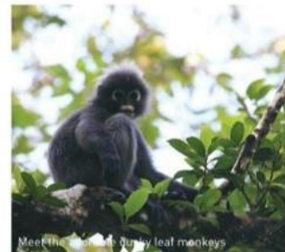
Meet the friendly local monkey

An olfactory heaven awaits in the form of Tropical Spice Garden . It is Southeast Asia's one and only award-winning tropical garden spanning over 8 acres of secondary jungle, filled with more than 500 tropical species of flora and fauna. Tropical Spice Garden was once an abandoned rubber plantation until its founders turned it into a tropical paradise with a soothing, zen-like environment. However, if you are not one to enjoy simply walking around the gardens, there are plenty of other activities to take part in.