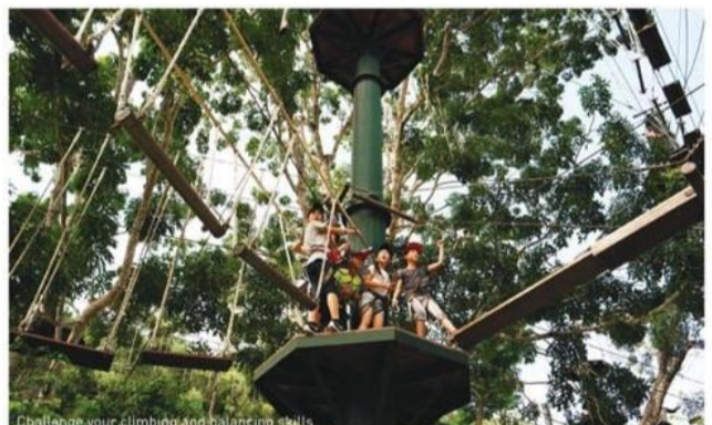
Challenge your climbing and balancing skills

Looking for exciting adventures and adrenaline-pumping thrills? Experience it all at ESCAPE where lots of exciting attractions await! Don't miss the chance to ride the world's longest water slide, measuring an impressive 1,111m! Winding through enchanting jungle treetops, this Guinness World Record water slide is packed with twists and turns for a mind-blowing four-minute ride.