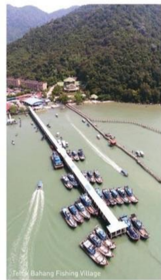
Teluk Bahang Fishing Village

Teluk Bahang was originally founded as an agricultural village where the majority of the population were fishermen. Over the years, it has gradually developed into a tourist destination dotted with a wide variety of attractions such as beaches, parks, gardens, theme parks, museums and farms. Serving as the perfect backdrop for photos, the captivating views add to its rustic charm.