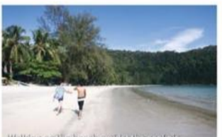
Walking on the beach amidst the cool air

Annual Homecoming Green sea turtles can be seen coming up on Pantai Kerachut to lay their eggs from April to August each year while olive ridley turtles come here during the months of September through February.