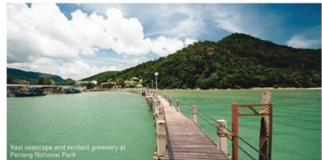
Vast seascape and verdant greenery at Penang National Park

Filled with many flourishing species of flora and fauna, the Penang National Park is a treasure trove of natural wonders comprising coastal hill dipterocarps, mangroves, beaches, and rocky shores. There are plenty of avenues to observe and photograph birds and forest animals in their natural habitat. With such a wide range of activities available, there is no reason to get bored in here.