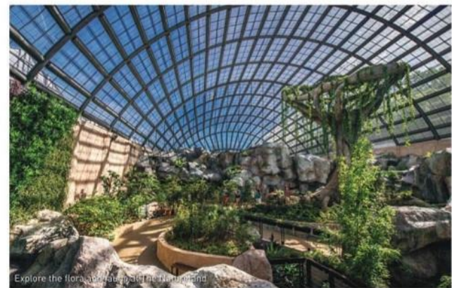
Explore the tropical rainforest in the Cocoon

The Cocoon is a state-of-the-art facility built along clean and modern lines. It features two floors of exhibitions designed to enhance learning as well as various indoor activities.