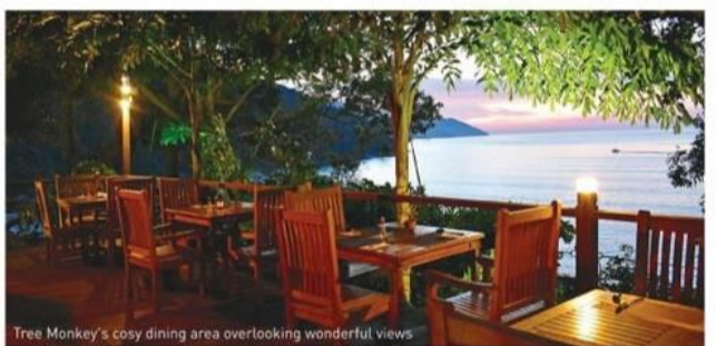
Tree Monkey's cosy dining area overlooking wonderful views

As part of the nation's food capital, Teluk Bahang is hailed by many as a place filled with fresh and mouthwatering seafood (after all, it is a fishing village). Some of the restaurants that have received many positive reviews are Tai Tong Seafood and Fishing Village Seafood Restaurant . These restaurants often present basins from which guests are invited to handpick their own live seafood to be prepared on the spot. Food doesn't get any fresher than that!