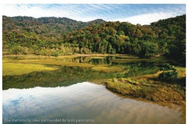
The meromictic lake surrounded by lush panorama

Natural Meromictic Lake Did you know there are fewer than 20 natural meromictic lakes in the whole world? Another natural meromictic lake is the famous Dead Sea. However, the Dead Sea is a permanent lake while ours is seasonal, happening during the change of monsoon (typically April-May and October-November).