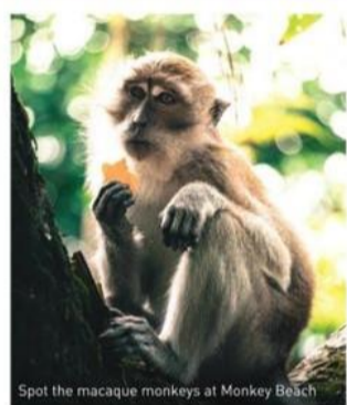
Spot the macaque monkeys at Monkey Beach

There are a few hiking trails beginning at the park entrance, each leading to different havens and wonders. The first trail is fairly easy and bears west for roughly 1.5 hours of easy walking before reaching the first stop, Monkey Beach derived its name from the macaque monkeys living within the vicinity. Accessible by boat or a hike, this scenic beach has shacks selling drinks and snacks as well as vendors offering water sports and quad bike excursions.