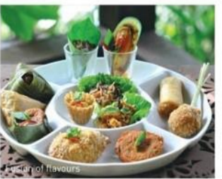
A variety of Thai dishes

range of Thai food made with the spices grown just next door in Tropical Spice Garden.