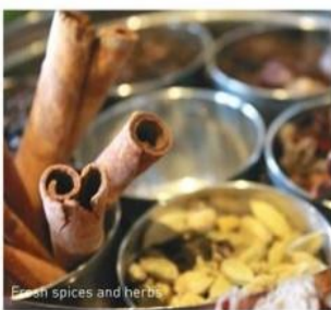
Spices and herbs

The Garden Tour (either guided or audio) is an exploration of tropical rainforest as well as the lavish foliage and exotic species of flowers growing in abundance in the gardens. The gardens are also filled with all manner of spices and herbs from around the world and a full tour of the gardens usually takes up to 2-3 hours. You can also learn how to cook Malay, Nyonya and Indian dishes through the hands-on cooking classes. Or you can just sit back, relax and enjoy the exotic Thai delights served at the Tree Monkey Restaurant.