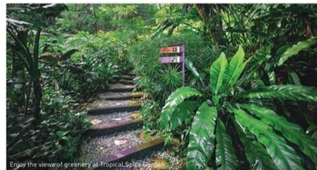
Enjoy the view of greenery at Tropical Spice Garden