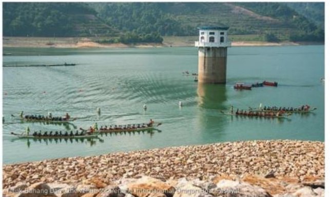
Vibrant Dragon Boats

Known as the largest dam in Penang, the Teluk Bahang Dam was built to serve as an alternative water supply. From its crest, one can enjoy a scenic view of the northern coast of the island. The dam has a height and length of 58.5m and 685m respectively, and a crest 12 metres thick, allowing for a roadway to be built along it.