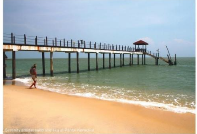
Serenity amidst sand and sea at Pantai Kerachut