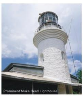
Prominent Muka Head Lighthouse

From there, you can choose to hike on for another 40 minutes to go to the Muka Head Lighthouse . Known as one of the three landmark lighthouses in Penang, it was built during the 1880s by the British administration as a guide to approaching boats. A stairway is open to the public from 9am to 3pm, spiraling all the way to the top of this prominent white granite tower from which a mesmerizing vista of the blue-green sea at Batu Ferringhi and Teluk Ketapang can be enjoyed.